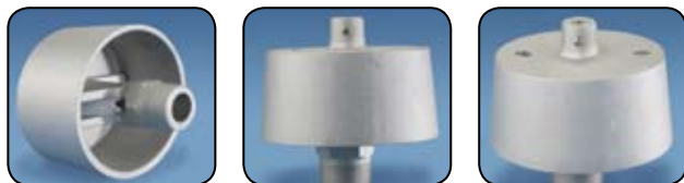
For Internal Halyard Poles • Threaded Type • Stationary • Single Pulley