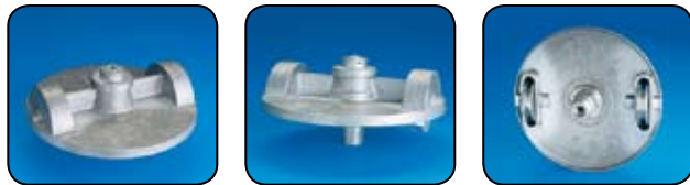
For External Halyard Poles • Threaded Type • Revolving • Double Pulley