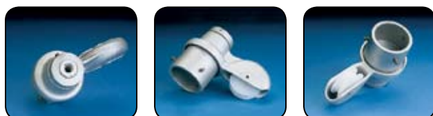
For External Halyard Poles • Cap Style • Revolving • Single Pulley