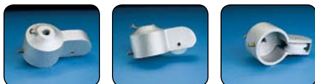
For External Halyard Poles • Cap Style • Stationary • Single Pulley