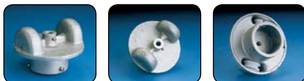
For External Halyard Poles • Cap Style • Stationary • Double Pulley