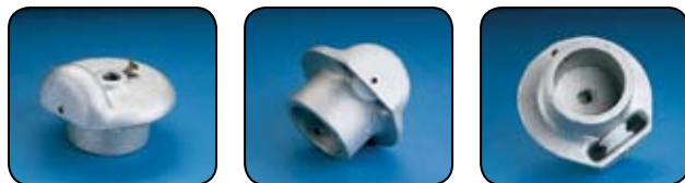
For External Halyard Poles • Cap Style • Stationary • Single Pulley