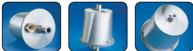
For Internal Halyard Poles • Threaded Type • Revolving • Single Pulley