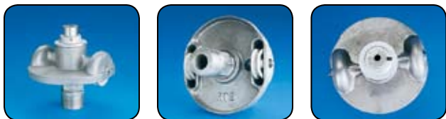
For External Halyard Poles • Threaded Type • Revolving • Double Pulley