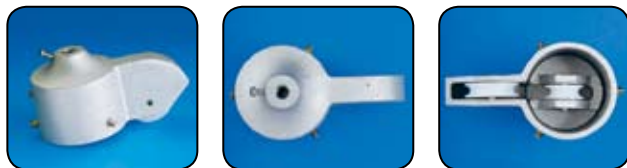
For Internal Halyard Poles • Cap Style • Stationary • Single Pulley