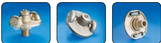
For External Halyard Poles • Threaded Type • Revolving • Double Pulley