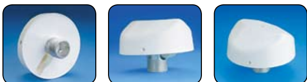
For Internal Halyard Poles • Threaded Type • Stationary • Single Pulley