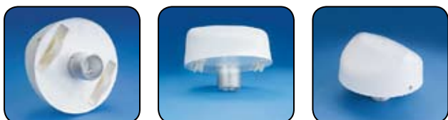
For External Halyard Poles • Threaded Type • Stationary • Double Pulley