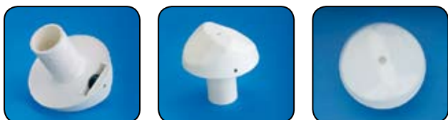
For External Halyard Poles • Slip Fit Type • Stationary • Single Pulley