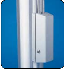
With Cylinder Lock