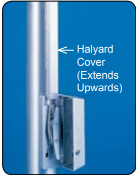
← Halyard Cover (Extends Upwards)